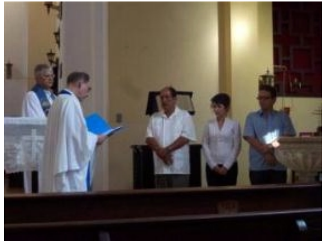
First New Church baptisms in Havana, on January 11, 2013.

A new important contribution is the translation of New Church materials from English into Spanish. Douglas had done some work with the papers of Reverend Appelgren for the 2013 Swedenborg Conference in Cuba, as well as for the