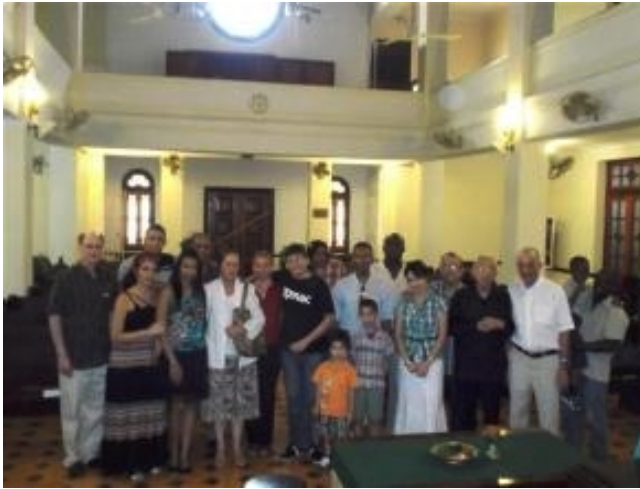
Some of the baptized members of the emerging community (2014).

Old Havana, while simultaneously undertaking theological debates with spirits and angels.